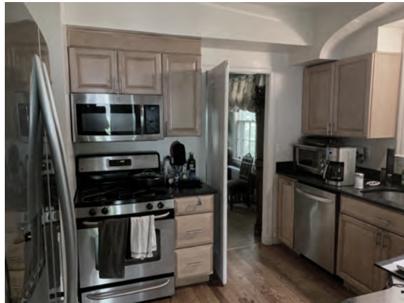
(above) Before view of the kitchen