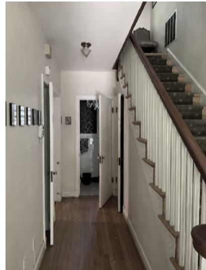
view from front entry hall, before (above) and after (right).