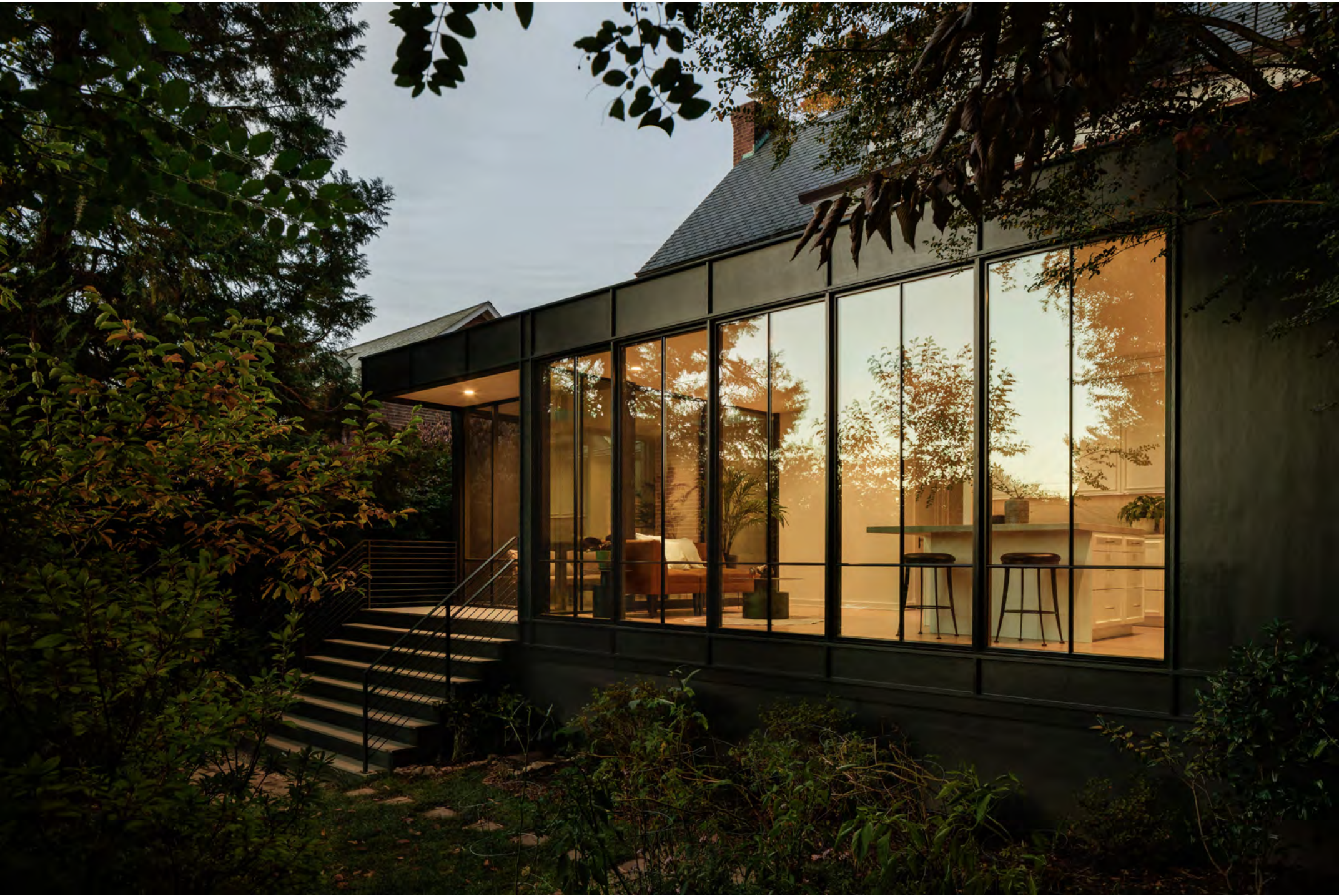
In the early morning, the sun rises facing the addition. The windows are lit by the rising sun and wall of windows reflects back the garden into itself.