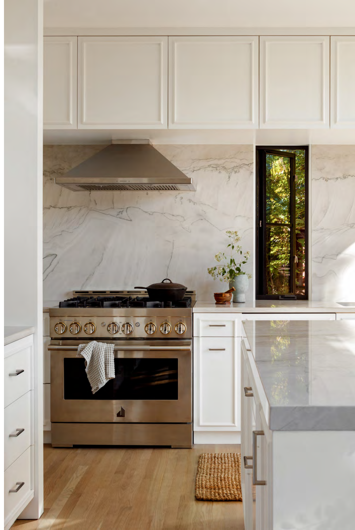
(left) New kitchen cooktop area. Operable windows at the sink and the large slider at the screened porch allow for opening up the addition along the North-South axis.