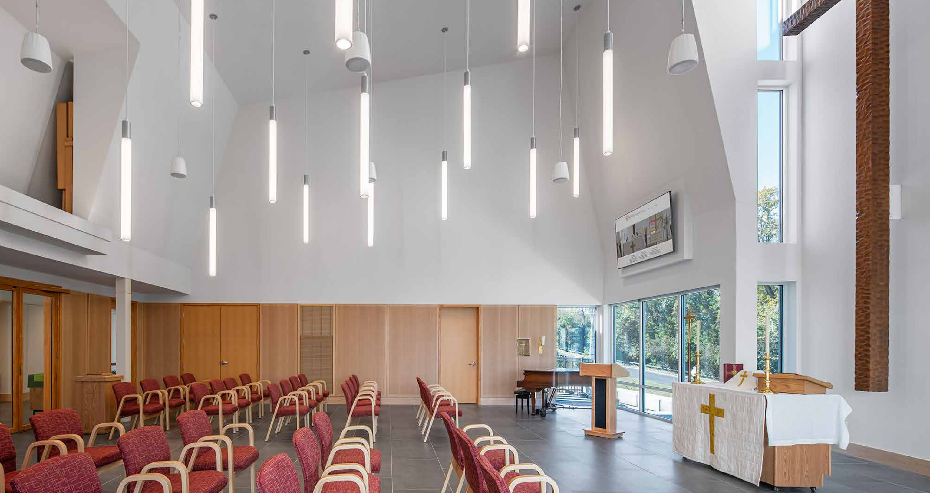
INTERIOR OF THE NEW NAVE / SANCTUARY