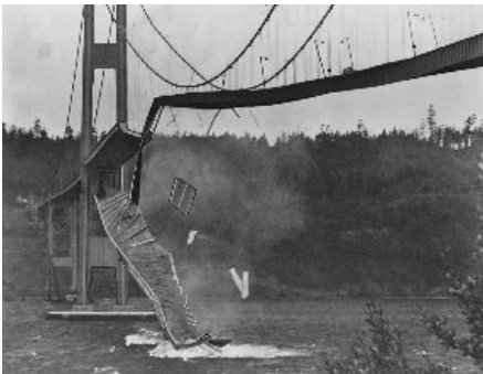
The Tacoma Narrows Bridge in Tacoma, WA collapsed on November 7, 1940, due to high winds.