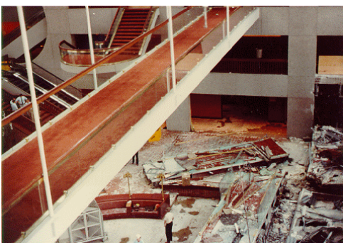
On July 17, 1981, two skybridges in the lobby of the Hyatt Regency Hotel in Kansas City, MO collapsed under the weight of people, due to a design change made during construction.

Courtesy of the Library of Congress, LC-USZ62-46682 (b&w film copy neg.)