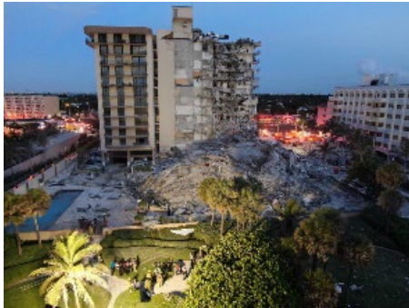
Champlain Towers South in Surfside, FL partially collapsed on June 24, 2021.