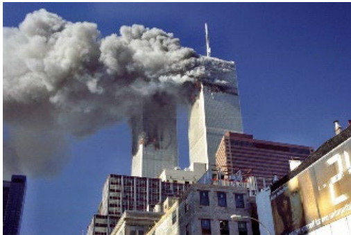
On September 11, 2001, terrorists deliberately flew planes into the Twin Towers in New York, NY.