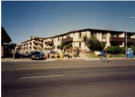
At the Northridge Meadows Apartments in Los Angeles, CA, the first story completely collapsed during the Northridge earthquake.