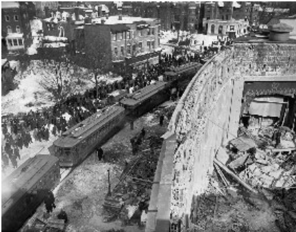
The roof of the Knickerbocker Theatre in Washington, DC collapsed on January 28, 1922, under the weight of 28 inches of snow.

Courtesy of the Library of Congress, LC-DIG-npcc-22642 (digital file from original)