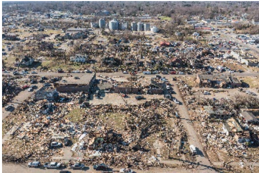
Aerial view of Mayfield, KY, showing devastation from the 2021 tornado.