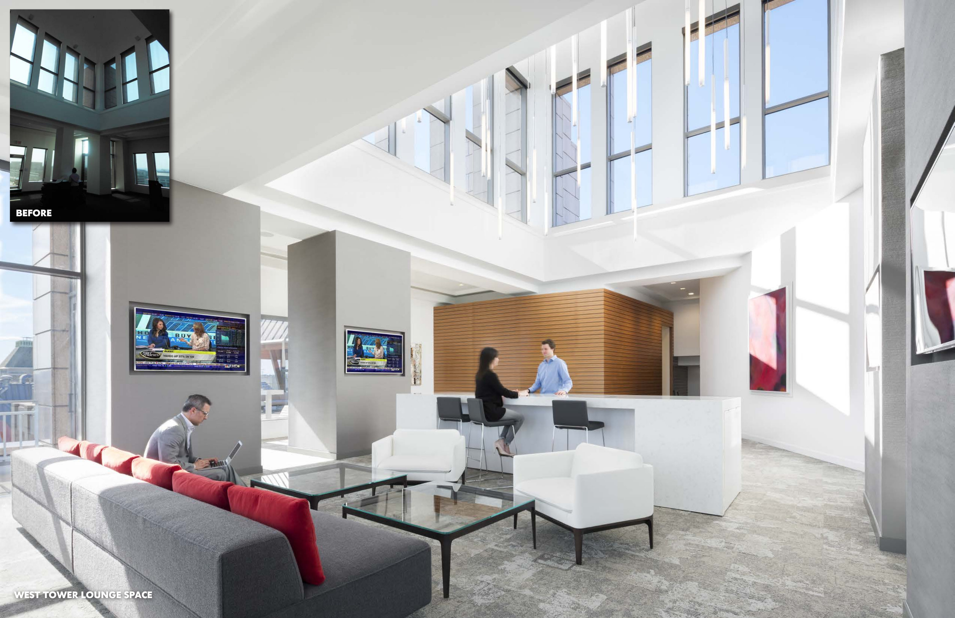
WEST TOWER LOUNGE SPACE