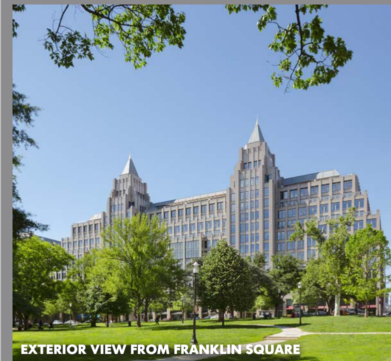
EXTERIOR VIEW FROM FRANKLIN SQUARE